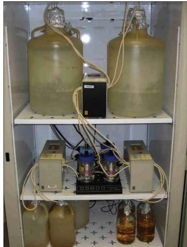
Figure 2. In-vitro microbial caries model.

Prior to varnish application, the teeth from all four groups were air dried. The copper varnish (Group 1 and Group 3) and 1% chlorhexidine varnish (Group 2) were placed following the manufacturer's instructions, while Group 4 received no treatment. The specimens were kept in humid conditions for 24 hours at 37°C, then the varnish was removed from Group 1 (peeled off using a scalpel). The removal technique had been previously tested in a small pilot study. Two methods were compared in the pilot study: a scalpel vs a toothbrush. The scalpel removed all of the visually remaining varnish, but microscopy demonstrated copper varnish residue on plugs inside the dentinal tubules, while